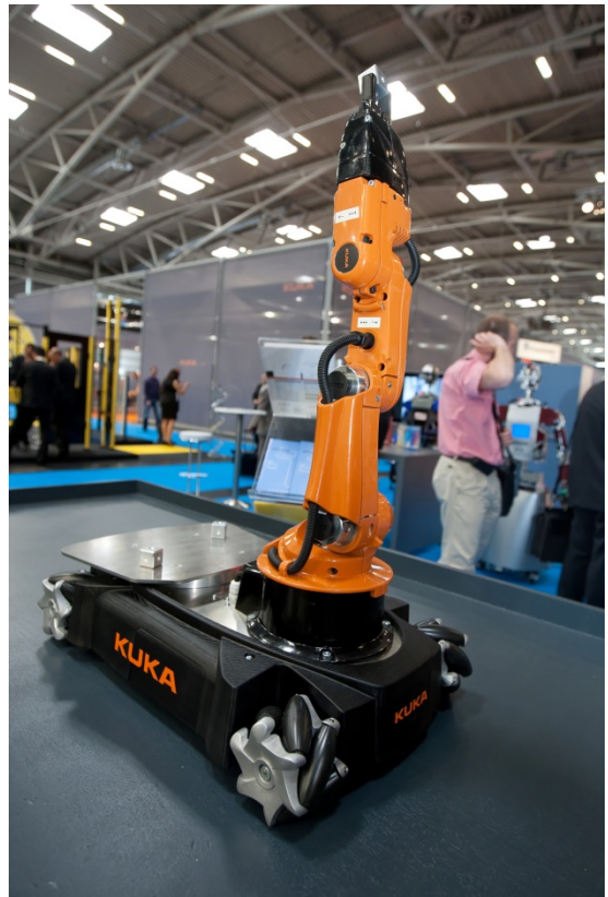
Figure 2: The robot's control software is a Linux-based open-source system equipped with various open interfaces.

Author: Anja Schütz, Redaktorin maxon motor ag Application story: 4071 characters, 642 words, 4 figures